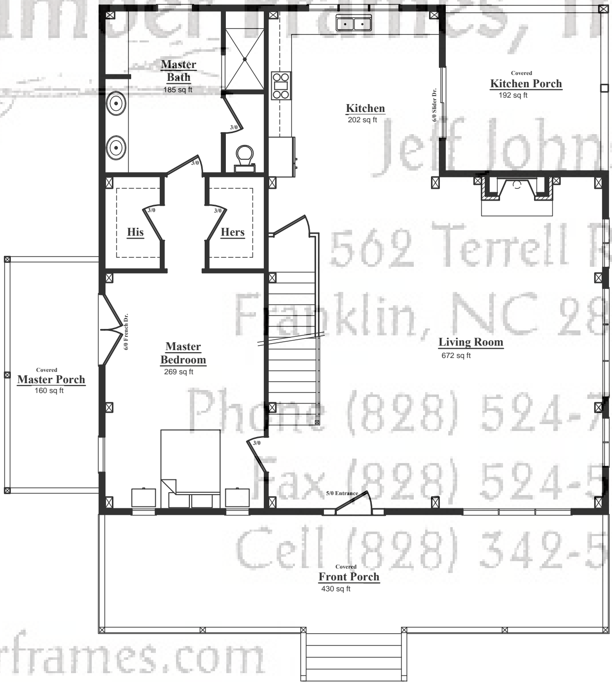
First Floor Plan 1,656 SF